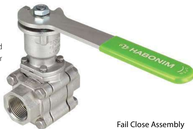
Fail Close Assembly

For mor information see Habonim Valve Accessories catalog.