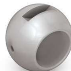
Cavity pressure relief (P250 Ball)