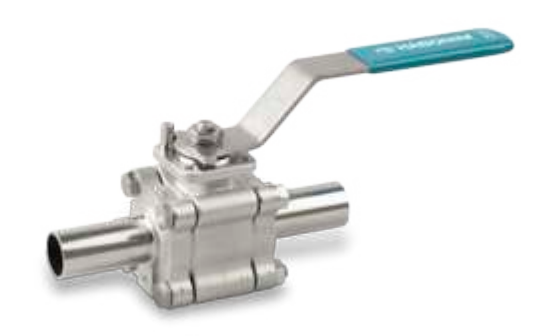
Three-piece, tube port F48G series