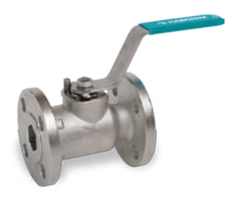
Flanged, #150/#300 F31G/F32G series