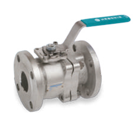
Flanged, full port #150/#300 F73G/F74G series

Flanged, full port PN16/PN40 F77G/F78G series