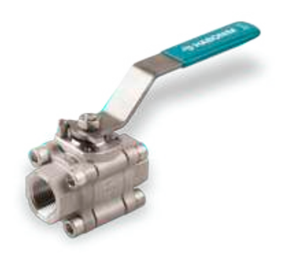
Three piece F47G series